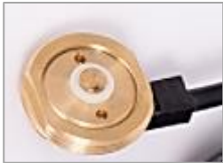
AC-NMO /Roof type